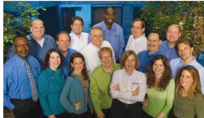
The SPARK staff